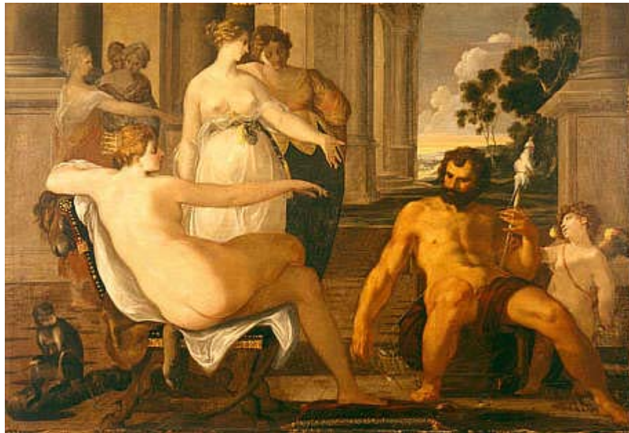
Laurent de Hyre (Paris 1606 – 1656): Hercules and Omphale, around 1626, Oil on canvas, 150 – 214 cm.

Please forgive me, I didn't intend to confuse you, I only wanted to show you what skills men and women can acquire and lose or relinquish. People can create their own identity, their own image. That's the whole point about doing gender. We can't do it on our own and so easily of course, it's a process that always takes place with other people in society, people who sometimes want to pigeonhole us. Your own ideas about yourself and your feelings are very important though. Be the person you wish to be! With the talents you've been given. Let's do gender!