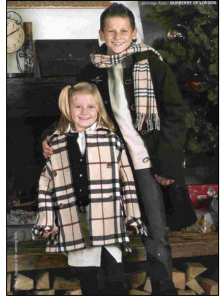
"The big brother" – Who affects (protects) whom?

The manner of expression appears to be natural and it is not realised that it is not the character itself but only the isolated signals, subject to the respective situation, sent by the acting person and sensed by the observer, that are considered important. Mühlen Achs (1993) points out that "the image of mankind in the media" due to "its striking stereotypes and curtain-fire-like presence" leads to an "evidence-goldmine" "in order to prove the leadership-function of the gender-specific body language". Mühlen Achs 1993, p.59).